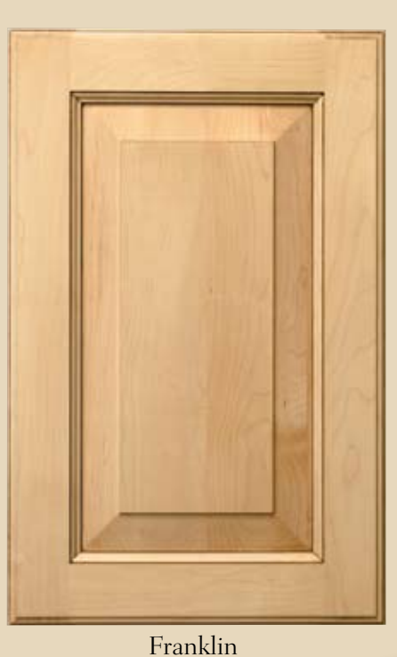
American Classic raised panel doors provide the enduring appeal and unmistakable craftsmanship that no other style can. From time-honored square panels to elegant arches, American Classic raised panel designs are both attractive and versatile